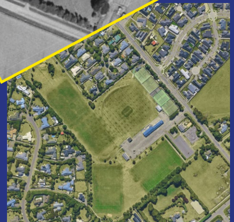
1950 Aerial photo of Prebbleton with the Domain pictured.